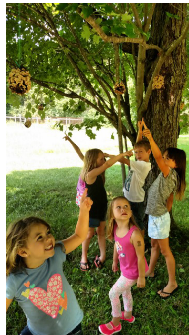
Hanging pine cone bird feeders