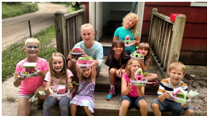
Making fairy houses